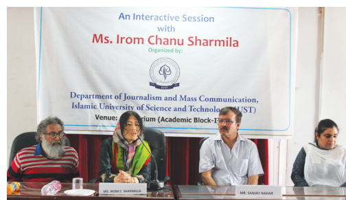
Irom Sharmila interacting with IUST faculty and students on June 5.

Talking about the Kashmir issue, she empathized with Kashmiri people for their "resistance" of decades. "I consider Kashmiris as my own