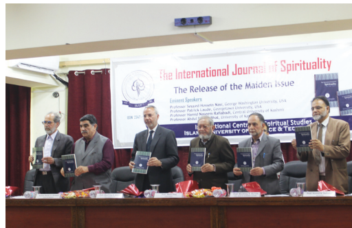
Maiden issue of The International Journal of Spirituality (TIJOS) , being released at university auditorium on May 2.

Pertinently, this is the maiden journal of the IUST. The launch ceremony started off with the lecture of Prof Seyyed Hossein Nasr, the editorial board member of the journal. He highlighted the role the journal can play in Kashmir and how it can emerge as a "centre for spreading the ethical framework" in South Asia. He also discussed the importance of reintroducing spirituality in the postmodern world, "where morality is altogether absent from the public discourse."