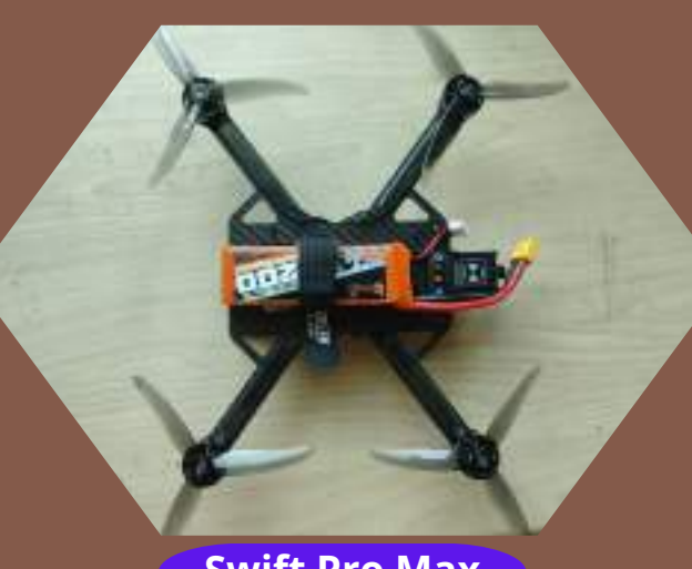
Swift Pro Max