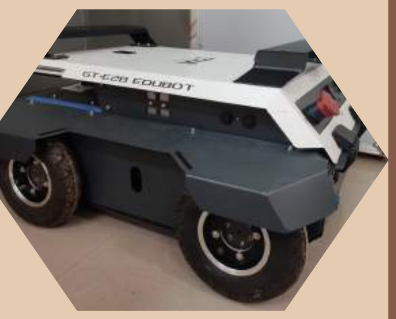
GT-E2B EDUBOT BY GOAT ROBOTICS