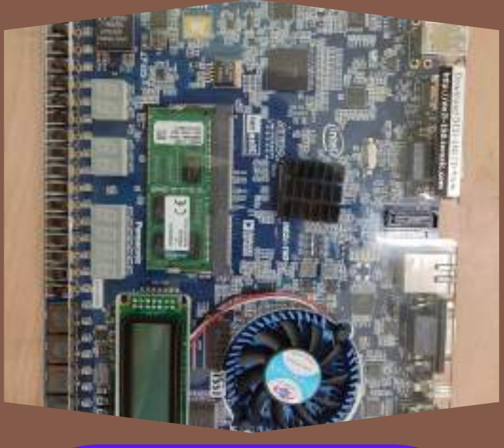
DE2i-150 DEVELOPMENT AND EDUCATION BOARD