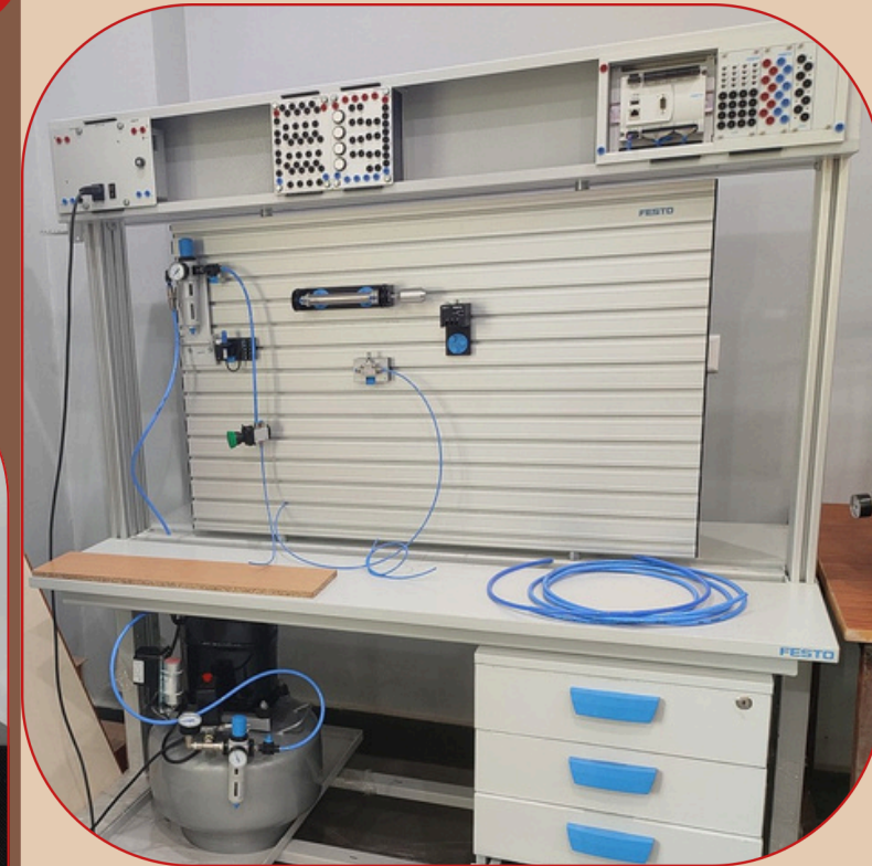
Festo Pneumatic Training Kit